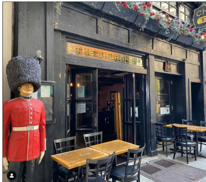
Celebrate the holidays with the World Ship Society, Port of New York Branch, at Churchill's Tavern.

PREVIEW: Saturday, December 10, 2022, 2 PM through 5 PM: WSS Holiday Party & Ocean Liner Bazaar The Churchill Tavern, Second Floor, 45 East 28th Street, www.thechurchillny.com