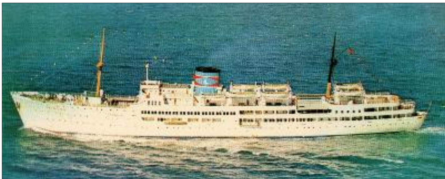
Painted in the colors of the Caribbean Cruise Lines and seen off Lower Manhattan (Top); Arriving at the Port of Miami, long before the development of Dodge Island. (Middle); The ARIADNE had sleek, yacht-like proportions (Bottom).