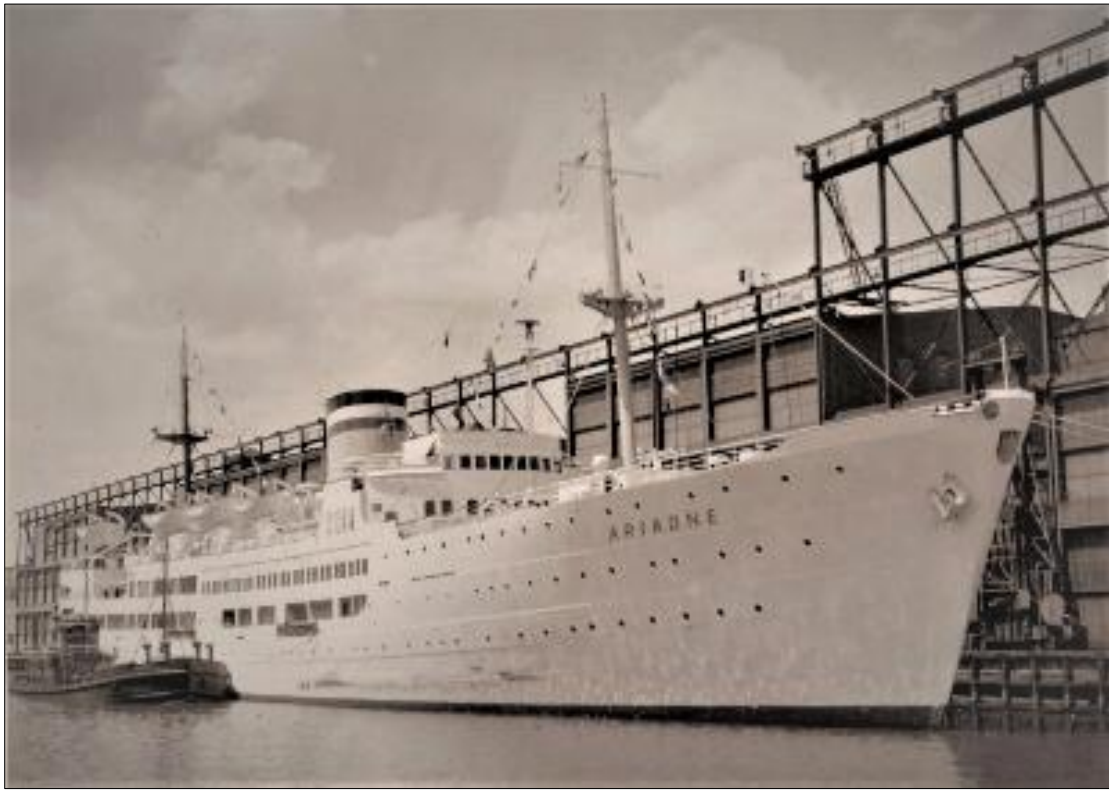
The ARIADNE at Pier 88, New York in a view dated June 1960.