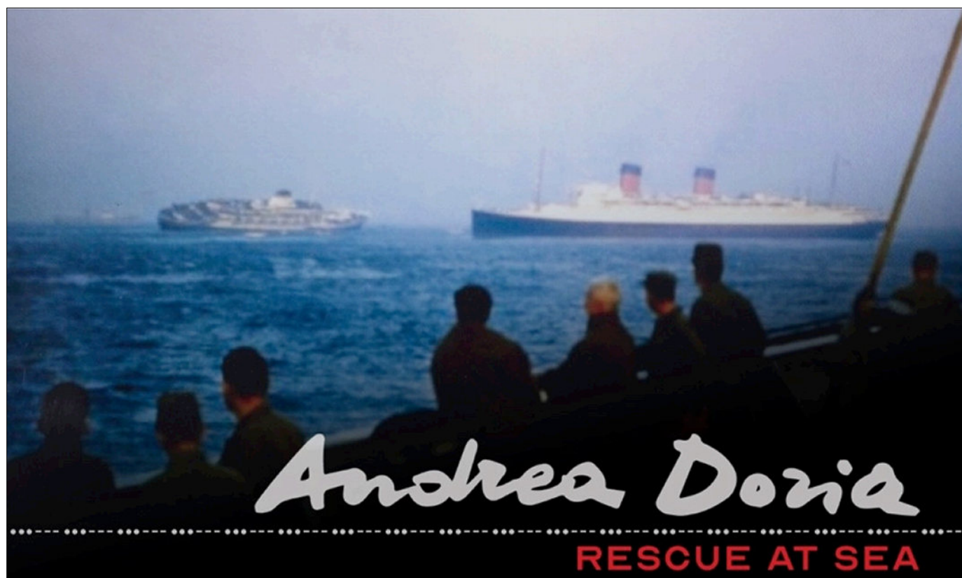
The ILE DE FRANCE stands by the sinking ANDREA DORIA in the early morning hours of July 26, 1956