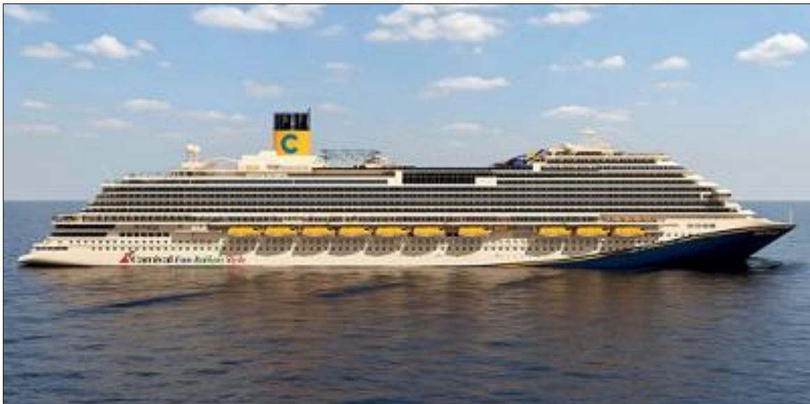
CARNIVAL VENEZIA will offer Costa Cruise Line design "Carnival Fun Italian Style" out of New York in 2023.

VENEZIA IN NEW YORK: The CARNIVAL VENEZIA, formerly COSTA VENEZIA, will be based year-round in New York beginning on June 15, 2023. The 135,225-ton vessel was completed in 2019 and began service out of Shanghai for the Chinese market. She will inaugurate the new Costa by Carnival concept, which is to showcase a flamboyant Italian atmosphere. In a somewhat confusing branding array, the CARNIVAL VENEZIA's name on her bows will read "COSTA VENEZIA." She will have Carnival's new swooping blue hull makings, but with a yellow accent stripe instead of red. Her yellow Costa dustbin funnel will have the blue "C" logo, while her hull tag line "Carnival Fun Italian Style" will feature an image of the iconic winged Carnival funnel in the company's red, white and blue paint scheme.