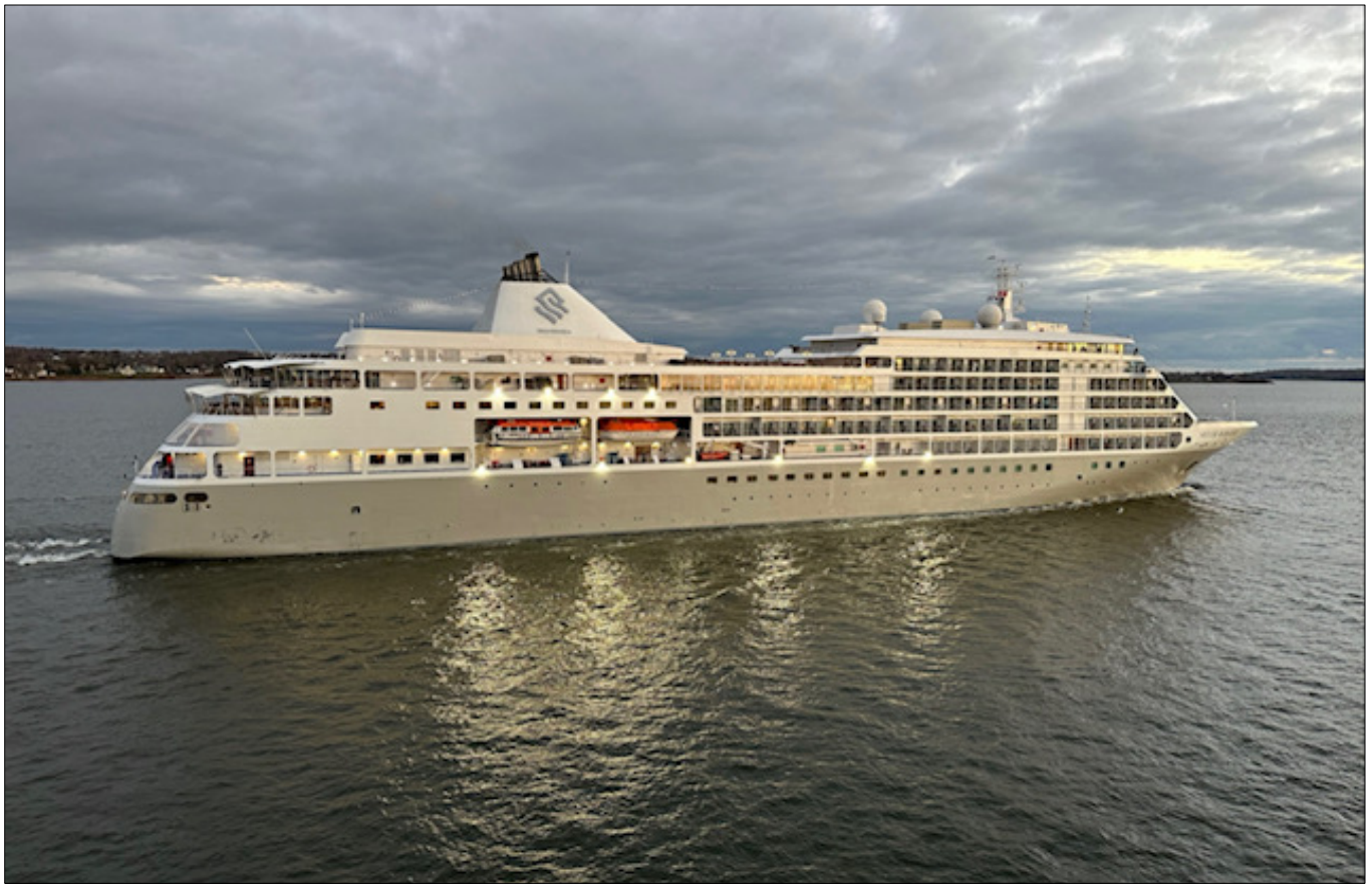
SILVER WHISPER departing Charlottetown, Prince Edward Island, October 2022.