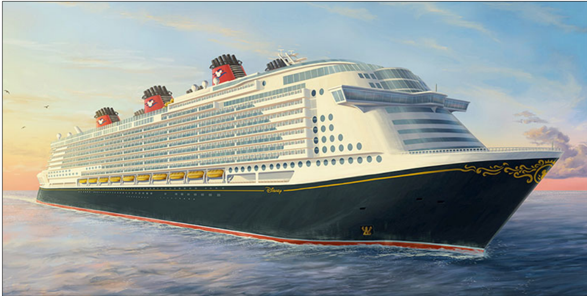
The former GLOBAL DREAM's profile will feature 3 pairs of funnels when she sets sail under the Disney banner in 2025.

VENEZIA IN NEW YORK: The CARNIVAL VENEZIA, formerly COSTA VENEZIA, will be based year-round in New York beginning on June 15, 2023. The 135,225-ton vessel was completed in 2019 and began service out of Shanghai for the Chinese market. She will inaugurate the new Costa by Carnival concept, which is to showcase a flamboyant Italian atmosphere. In a somewhat confusing branding array, the CARNIVAL VENEZIA's name on her bows will read "COSTA VENEZIA." She will have Carnival's new swooping blue hull makings, but with a yellow accent stripe instead of red. Her yellow Costa dustbin funnel will have the blue "C" logo, while her hull tag line "Carnival Fun Italian Style" will feature an image of the iconic winged Carnival funnel in the company's red, white and blue paint scheme.