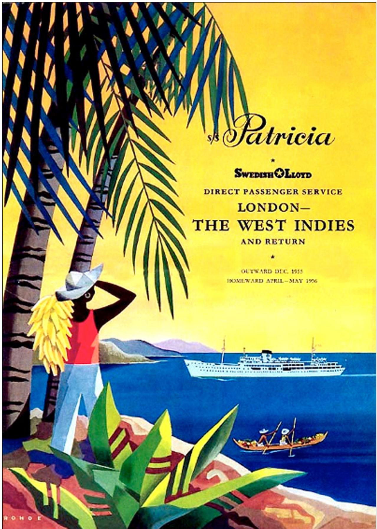
A brochure for cruises on Sweden's PATRICIA from the early 1950s.