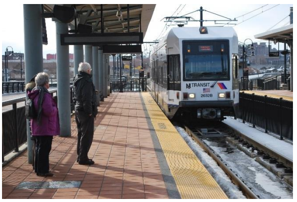
HBLR train arriving at Hoboken Terminal. (Ted Scull)