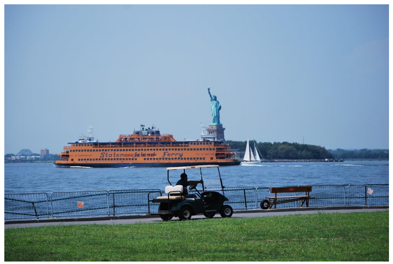
View of a Molinari-class Staten Island Ferry passing the Statue of Liberty. (Ted Scull)

Governors Island (seasonal: May 1 - October 31) is a 172-acre island with parkland and historic buildings. A walkway circumnavigating the island offers views of vessels navigating the entire Upper Bay, parts of the South Brooklyn waterfront, and Buttermilk Channel, the location of the Brooklyn Cruise Terminal (where Cunard's Queen Mary 2 berths) and the Red Hook Marine Terminal which serves mid-size container ships. The island has a man-made hill that provides an excellent 360-degree photo location.