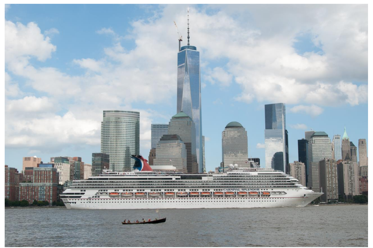
View from Exchange Place of Carnival Cruise Line's outbound CARNIVAL SPLENDOR passing lower Manhattan.

A waterfront plaza adjacent to the Hyatt Regency Jersey City along with the neighboring J. Owen Grundy recreation pier provide sweeping views of the Hudson River and Upper New York Bay with the lower Manhattan skyline as a backdrop.