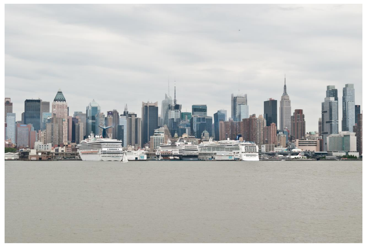
View of the Manhattan Cruise Terminal from Weehawken, NJ, with CARNIVAL GLORY at Pier 90 and VEENDAM and NORWEGIAN GEM at Pier 88.

NY Waterway's Port Imperial/Weehawken ferry terminal is located opposite the Manhattan Cruise Terminal and provides a water-level vantage point with good afternoon sun for photographing departing ships reversing into midstream before sailing south.