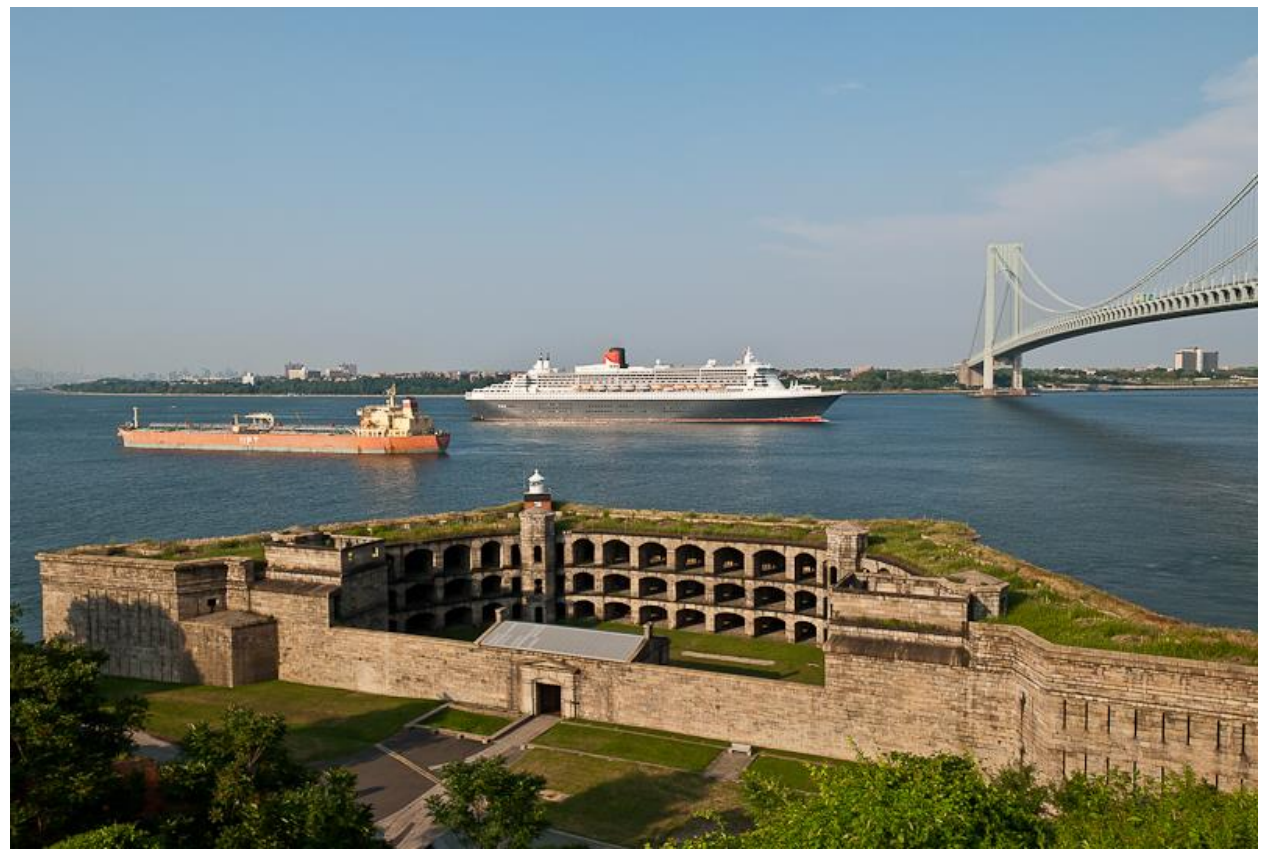
View from Fort Wadsworth of Cunard's QUEEN MARY 2 outbound at the Narrows.

Fort Wadsworth – Gateway National Recreation Area, Staten Island