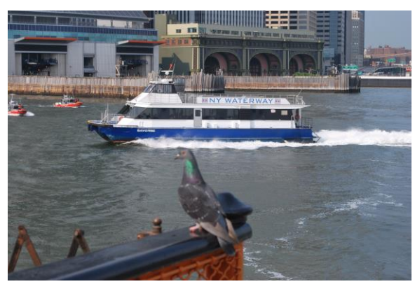
NY Waterway ferry BAYONNE. (Ted Scull)

There are a variety of locations along New Jersey's Hudson River (aka North River) waterfront that provide excellent opportunities to photograph passing ships. The lighting is especially good for afternoon departures from the Manhattan Cruise Terminal, with various locations offering bow, broadside and/or stern shots with the Midtown, Chelsea, Greenwich Village or Lower Manhattan skylines as a backdrop. Many of these locations are accessible from Manhattan via public transit services including: NY Waterway ferry service operating between multiple locations in both Manhattan and New Jersey; NJ Transit bus service between Manhattan's Port Authority Bus Terminal and Hoboken, NJ; PATH trains operating from midtown Manhattan and Greenwich Village to Hoboken, and from the World Trade Center to Exchange Place in Jersey City, NJ, and Hoboken; and Hudson-Bergen Light Rail (HBLR) service that operates on a north-south alignment along the New Jersey waterfront through Weehawken, Hoboken, Newport and Exchange Place. Locations are listed below from north to south, with information on transit access provided for each location.