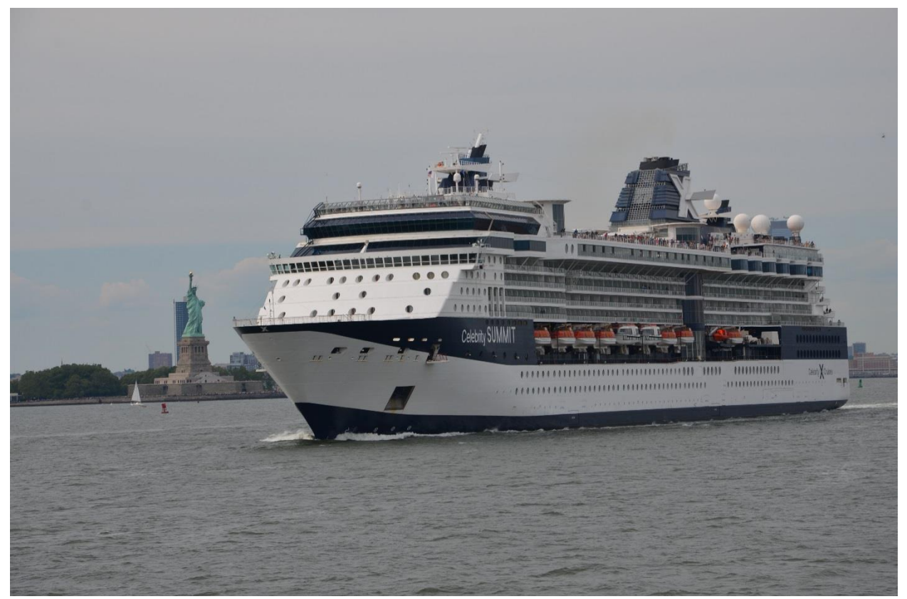
View of Celebrity Cruises' Celebrity Summit from a passing Staten Island Ferry.

View maritime traffic in the Upper Bay from the ferry, then once ashore at St. George on Staten Island, head to an observation point just outside the ferry terminal's north side to view all manner of traffic moving through the Upper Bay, including cruise ships leaving the Cape Liberty Cruise Port in Bayonne, New Jersey, tankers, and container ships and auto carriers using the Kill van Kull to reach Port Newark, Port Elizabeth and the New York Container Terminal facility at Howland Hook on Staten Island. The ferry ride is free, and operates between the Whitehall Ferry Terminal at South Ferry at the southern tip of Manhattan and the St. George Terminal on Staten Island every 15 minutes during rush hours and every 30 minutes during other daytime hours.