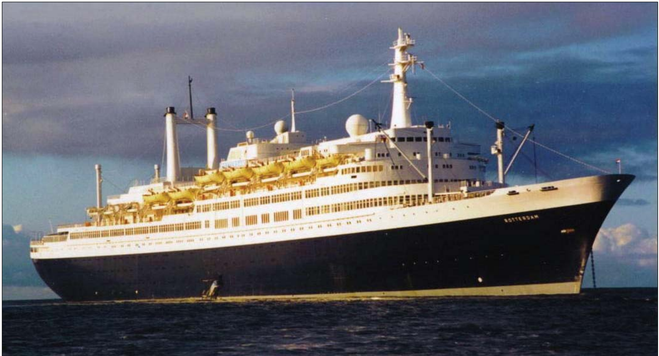
s.s ROTTERDAM V