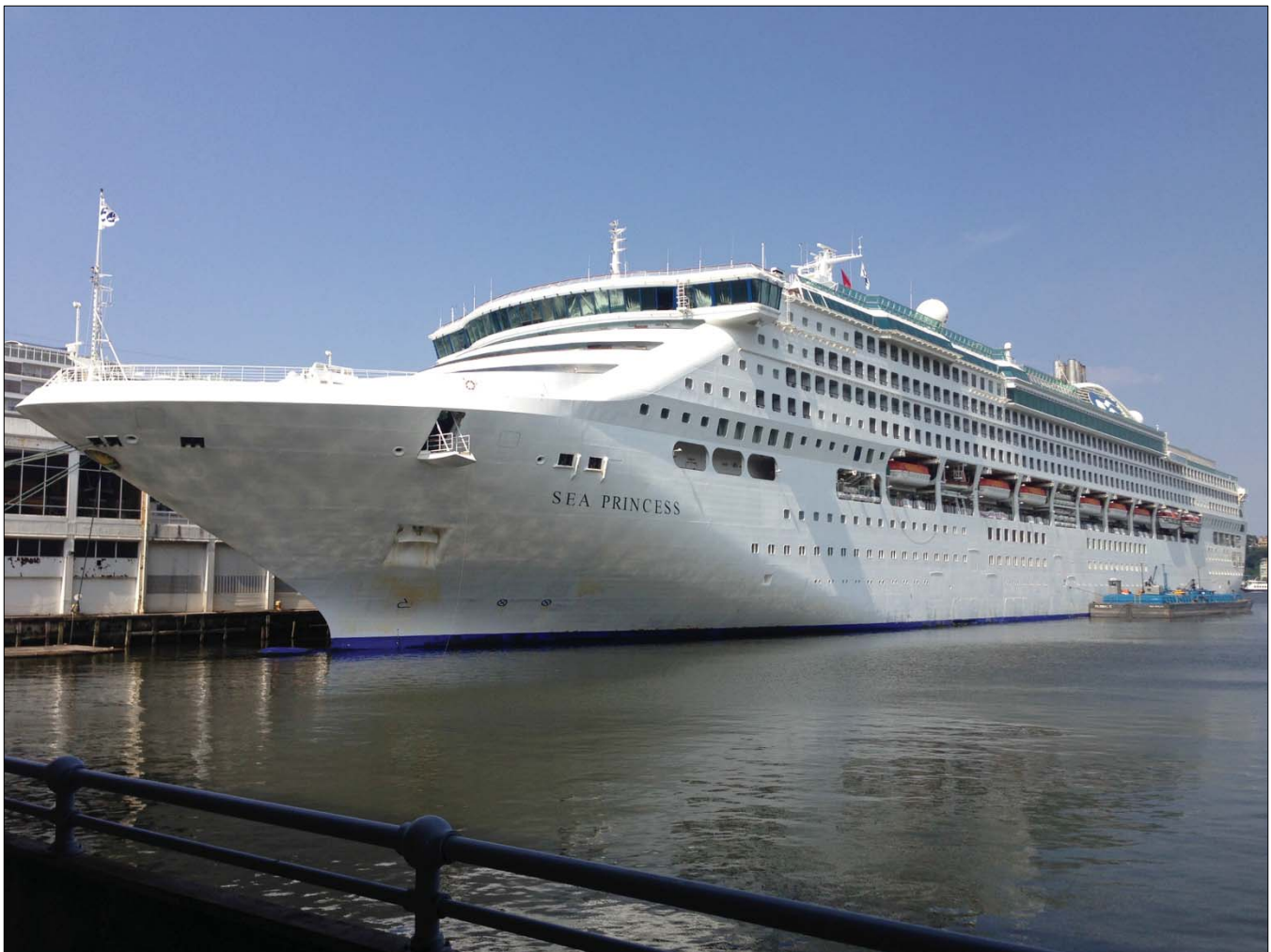
Princess Cruises' SEA PRINCESS, seen here at New York on July 26, hosted 112 PONY members and friends on a very warm summer day.