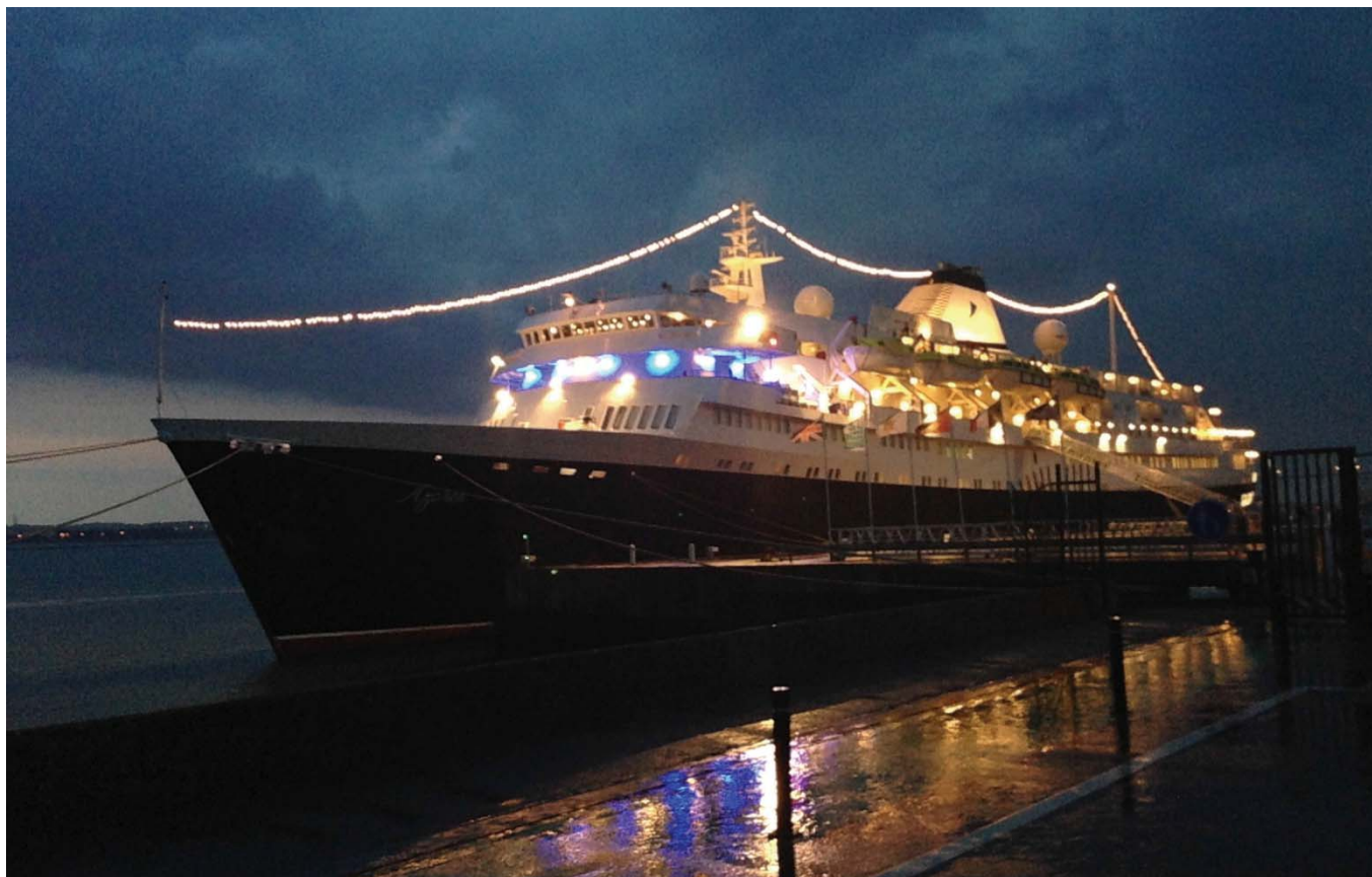
AZORES at Honfleur, France, June 2015