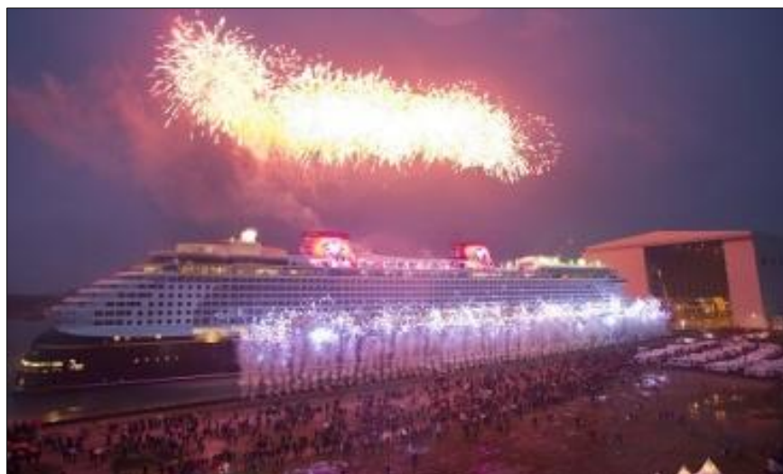
Fireworks lit the sky as the 128,000-ton DISNEY DREAM was floated out of her Meyer Werft building berth on October 30, 2010.