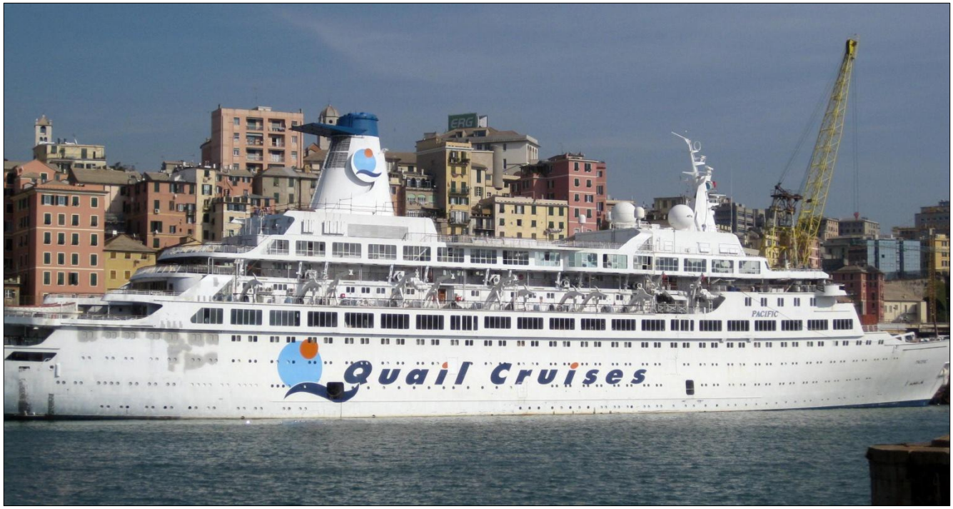
The PACIFIC at Genoa in October, 2010