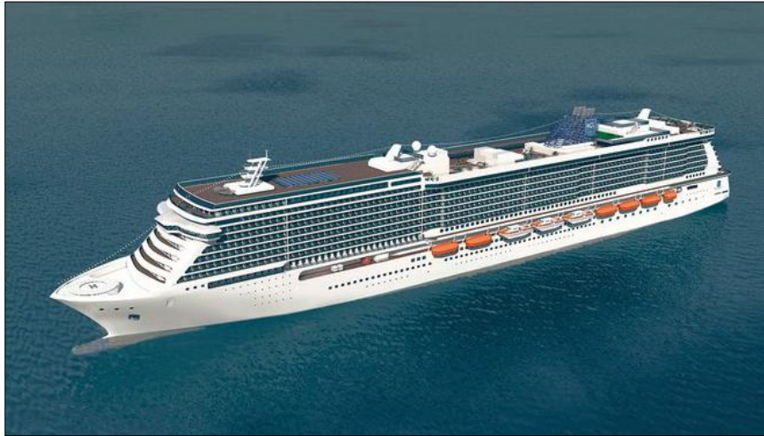
A rendering of the new Norwegian Cruise Line sister ships.