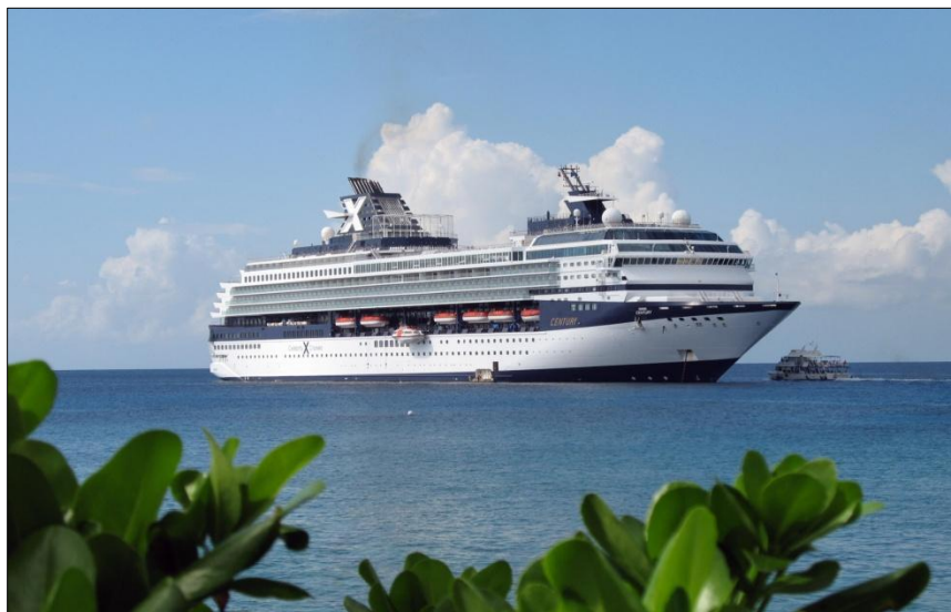
CENTURY, built by Meyer Werft in 1995, is one of the yard's most successful cruise ships.

The new ships will together cost approximately 1.2 billion Euros. NCL stated that it has commitments in place from a syndicate of banks for export credit financing in connection with this project. Shortly after announcing that it had ordered the new ships, NCL announced its earnings for the quarter. Net income for the third quarter of 2010 was $93.0 million on revenue of $634.1 million compared to net income of $85.6 million on revenue of $550.7 million in 2009. EBITDA for the quarter improved 21.4% to $184.1 million versus $151.6 million for the same period in 2009. It also announced that it had filed a registration statement with the Securities and Exchange Commission for an initial public offering. At present, the line is privately owned. In January 2008, the Apollo Funds and the TPG Viking Funds acquired 50% of NCL. As part of this investment, the Apollo Funds obtained control of NCL's board of directors. The remaining 50% of the company is owned by Genting HK (formerly Star Cruises), an Asian cruise and gaming operator.