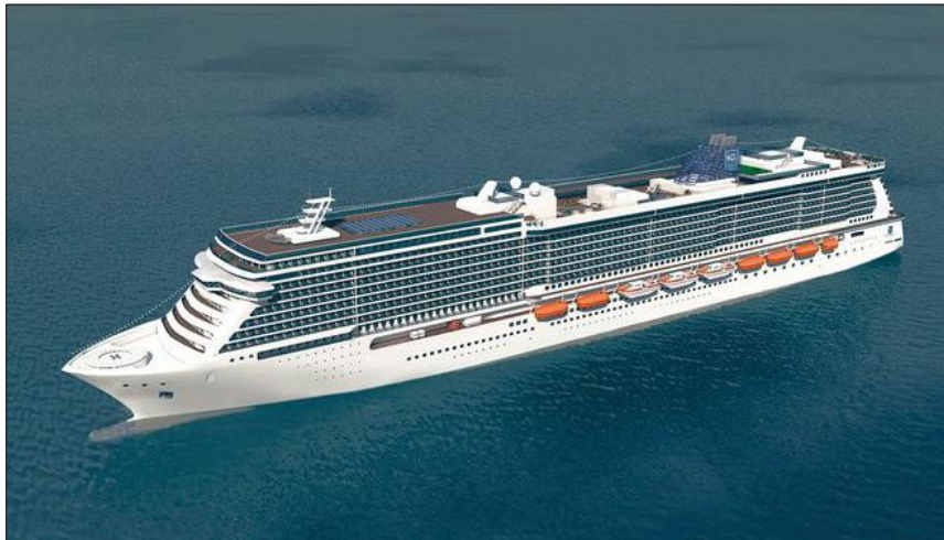
A rendering of the new Norwegian Cruise Line sister ships.