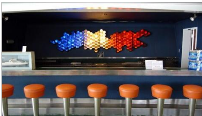
Stylish 'sixties SAVANNAH interiors: the beautifully restored reception lobby (left), and the bar (right).