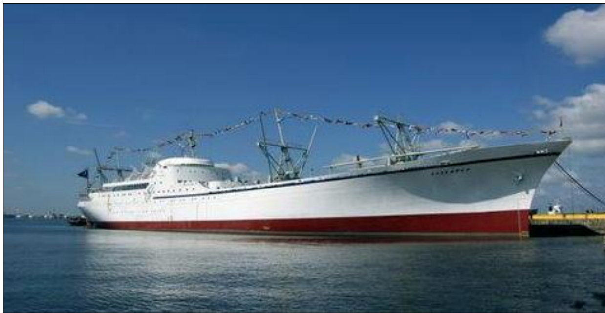
SAVANNAH, dressed overall on a sunny National Maritime Day, May 21 2011, in Baltimore, MD.