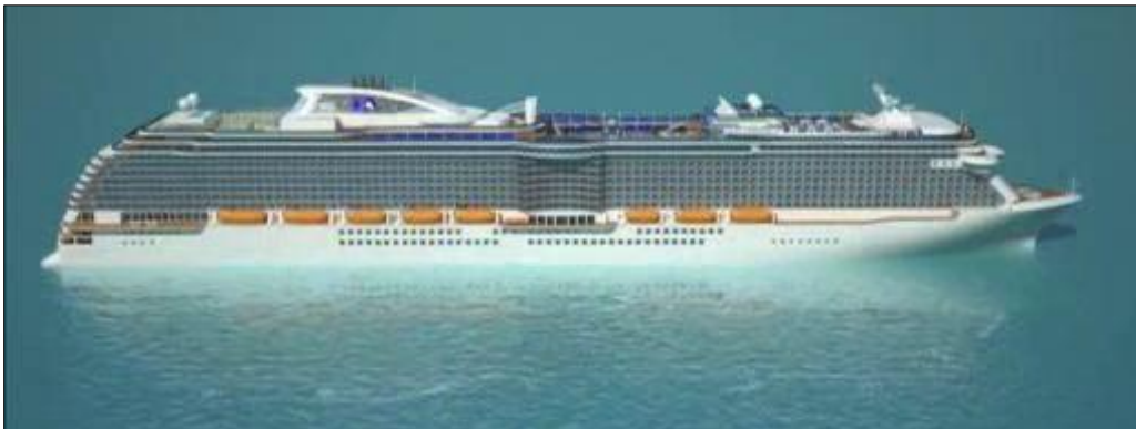
The ROYAL PRINCESS and P&O's new ship are clearly designed on the same platform.