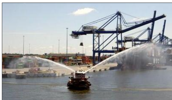
The SAVANNAH's wheelhouse (left); a fireboat salutes SAVANNAH on National Maritime Day (right).