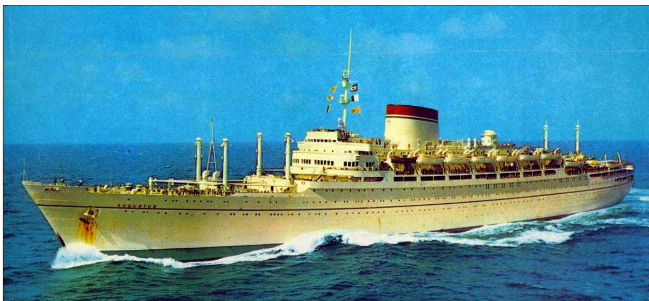
Italian Line's magnificent AUGUSTUS of 1952, one of the preserved passenger ships of Asia.

Retired in 1960, the ship was permanently moored at Yokohama and adapted for new use as a youth hostel and museum. Closed briefly in recent years, the ship is now operated as a museum by NYK line. One of only three pre-World War II passenger liners still afloat.