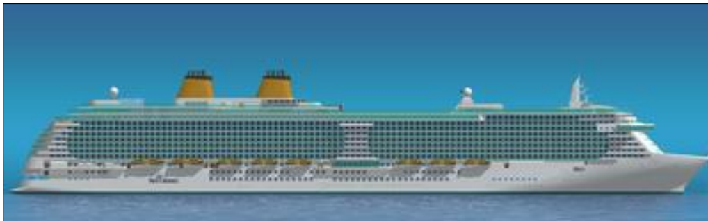
P&O Cruises new 141,000-ton vessel will be the largest ever for the 174 year old company.