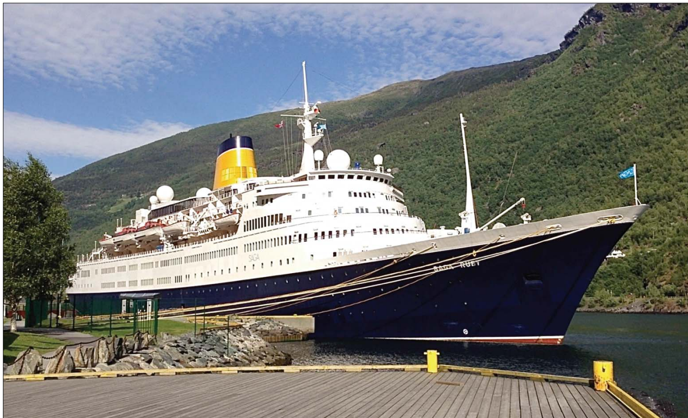
SAGA RUBY at Flam, Norway, July 9, 2013.