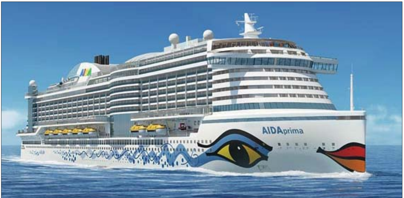
AIDAPrima is an innovative vessel with a knife-like bow, built on an entirely new platform. She is scheduled for weekly Northern European cruises from Hamburg during her first season.

FIERY DAYS FOR AIDA: Three fires broke out in the month of January on AIDA Cruises' AIDAPrima, currently under construction at Mitsubishi Heavy Industries Shipyard in Nagasaki, Japan. The fires were quickly extinguished, and there were no injuries; arson is strongly suspected. The maiden voyage of the 125,000-ton ship, AIDA's largest, is scheduled to depart Hamburg on April 30, 2016. The new liner's first voyage has been postponed due to numerous construction delays. She was to have sailed a maiden cruise from Japan to Germany in 2015.