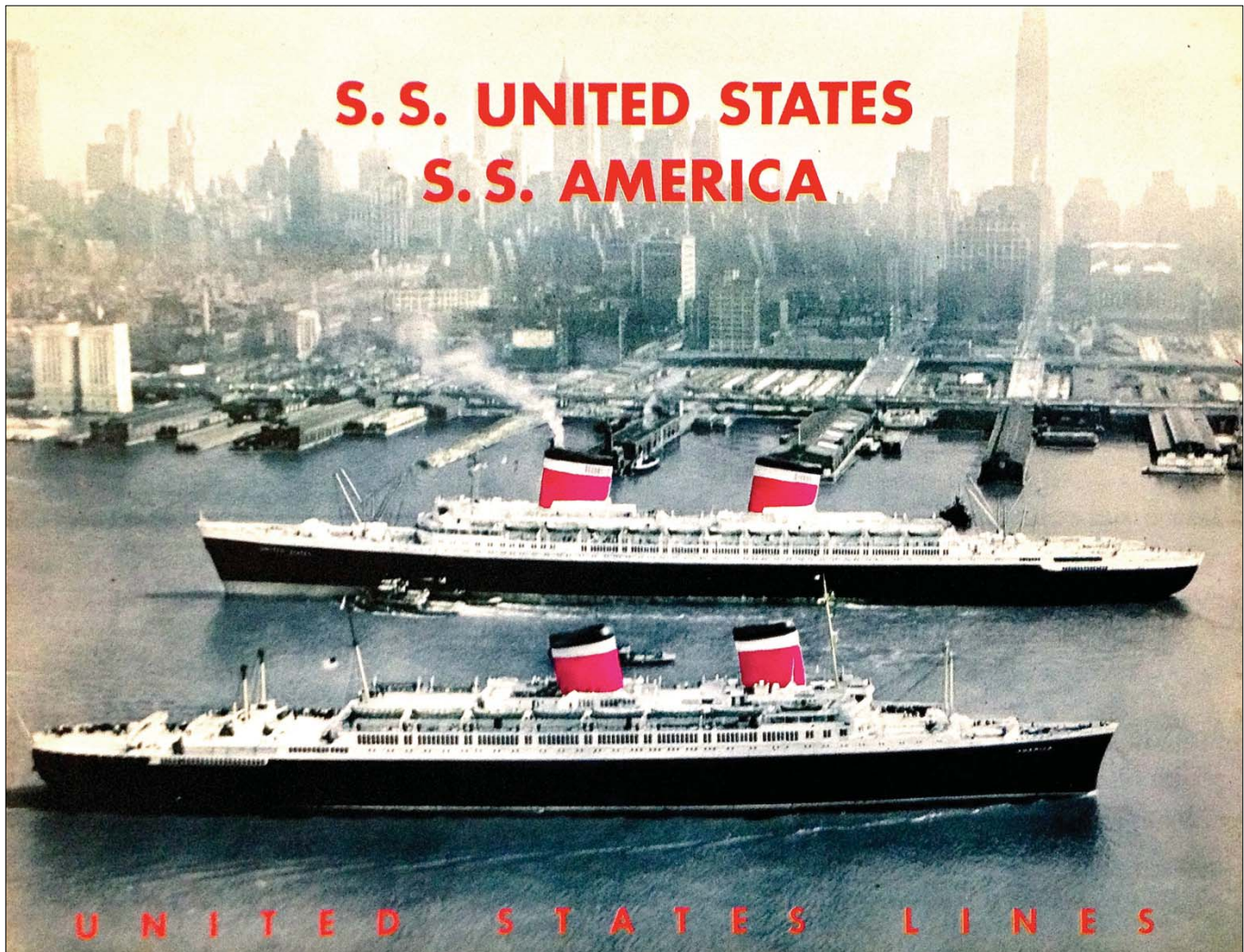
An early 1950's brochure cover shows the UNITED STATES (1952) heading up the Hudson River towards her berth at West 46 th Street. Her Europe-bound running mate AMERICA (1940), in the foreground, is sailing downstream. Should Crystal Cruises' renovation plan for the UNITED STATES be successful, she may once again sail past the New York City skyline.