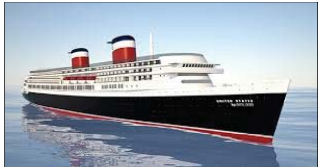
Above left, the UNITED STATES in 1965, and above right, a preliminary rendering of her as a luxury cruise ship.