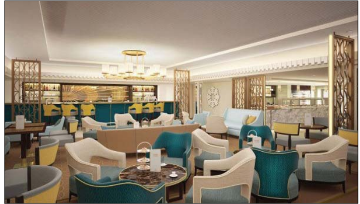
The QUEEN MARY 2 "Remastered" will feature a renovated King's Court Restaurant (above left) and the Carinthia Lounge (above right), which will replace the current Winter Garden.