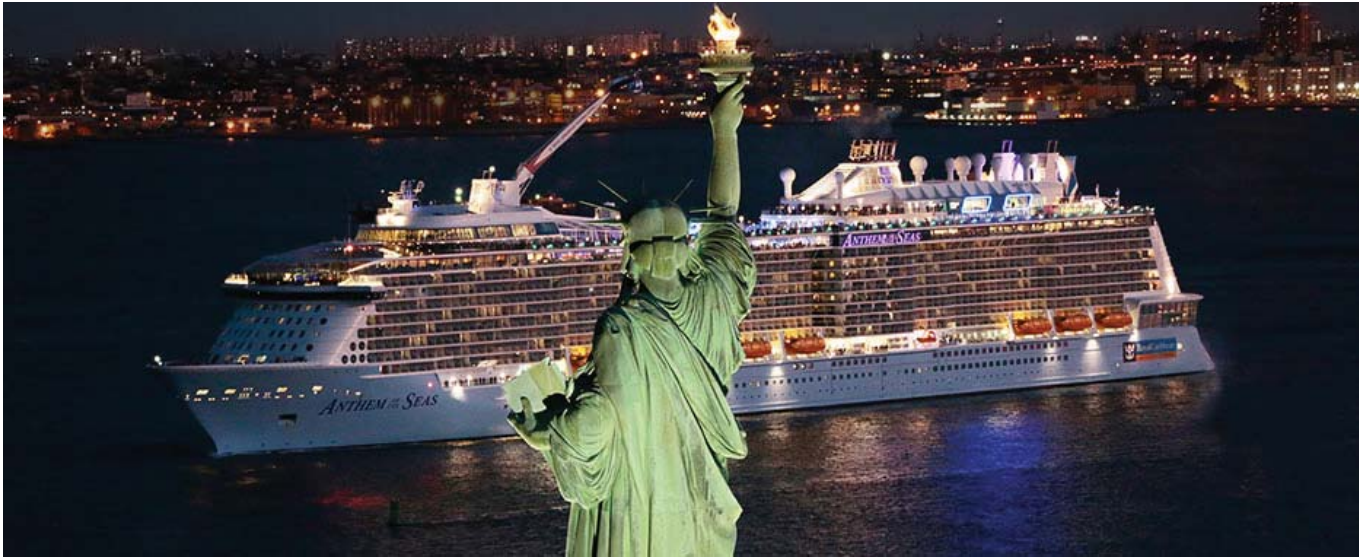
Royal Caribbean's ANTHEM OF THE SEAS in the sheltered waters of Upper New York Bay.

ROUGH RIDE FOR ANTHEM: Royal Caribbean's newest vessel, the ANTHEM OF THE SEAS, encountered extremely rough waters after departing Cape Liberty (Bayonne), NJ on her February 6 sailing. During the second afternoon at sea (which was Super bowl Sunday), the ship was battling 30-foot seas and winds in excess of 100 mph off the South Carolina coast. Passengers were restricted to their cabins as the 168,000-ton ANTHEM, her 4,529 passengers and 1,616 crew shuddered violently in the churning ocean. Furniture was tossed about, glassware and windows shattered, and part of a ceiling on deck 14 collapsed. Water reportedly reached the promenade on Deck 5, penetrating exterior doors and soaking carpets in many locations; watertight doors were closed as a precaution. Remarkably, the Super bowl continued to stream live into the ship's TV system during the height of the storm! Although the damage to the ship was not structural, the captain decided to cancel the cruise, and the ANTHEM headed back to Bayonne once the seas began to calm down early Monday morning. Royal Caribbean attributed the situation to an unexpectedly strong winter storm, but NOAA issued an alert for hurricane-force winds in the Atlantic the afternoon before the ANTHEM left Bayonne, followed by a hurricane winds forecast on sailing day. As compensation to the passengers, Royal Caribbean will refund the entire price of the aborted cruise, and offer a 50% discount on a future cruise.