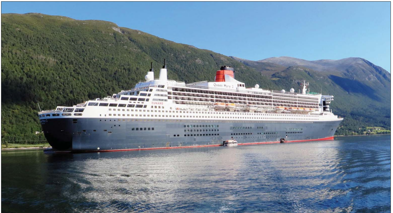
QUEEN MARY 2