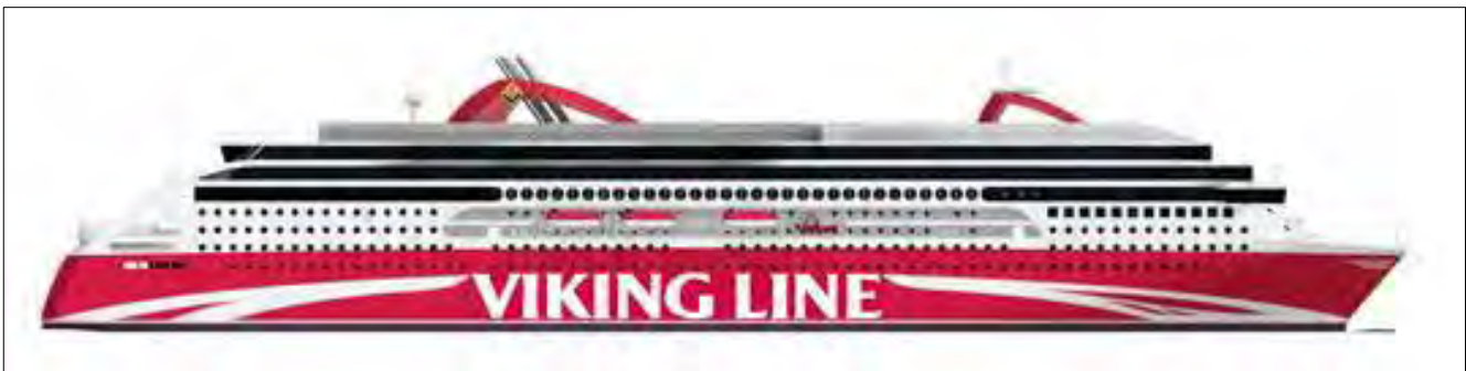
Viking Line's new LNG 57,000-ton cruise ferry will be a very environmentally-friendly vessel.

Viking Line has ordered a 57,000-ton cruise ferry from the STX Finland yard in Turku that will be one of the most environmentally-friendly passenger ships ever built. She will operate in the shallow waters of the Finnish and Swedish archipelago, and is designed to minimize wave forming, noise and emissions. The unnamed vessel will have a capacity for 2,800 passengers, as well as 1,275 lane-meters for trucks and a separate deck with 500 lane-meters for passenger cars. Delivery to Viking Line is scheduled for early 2013, and there is an option for a sister ship.