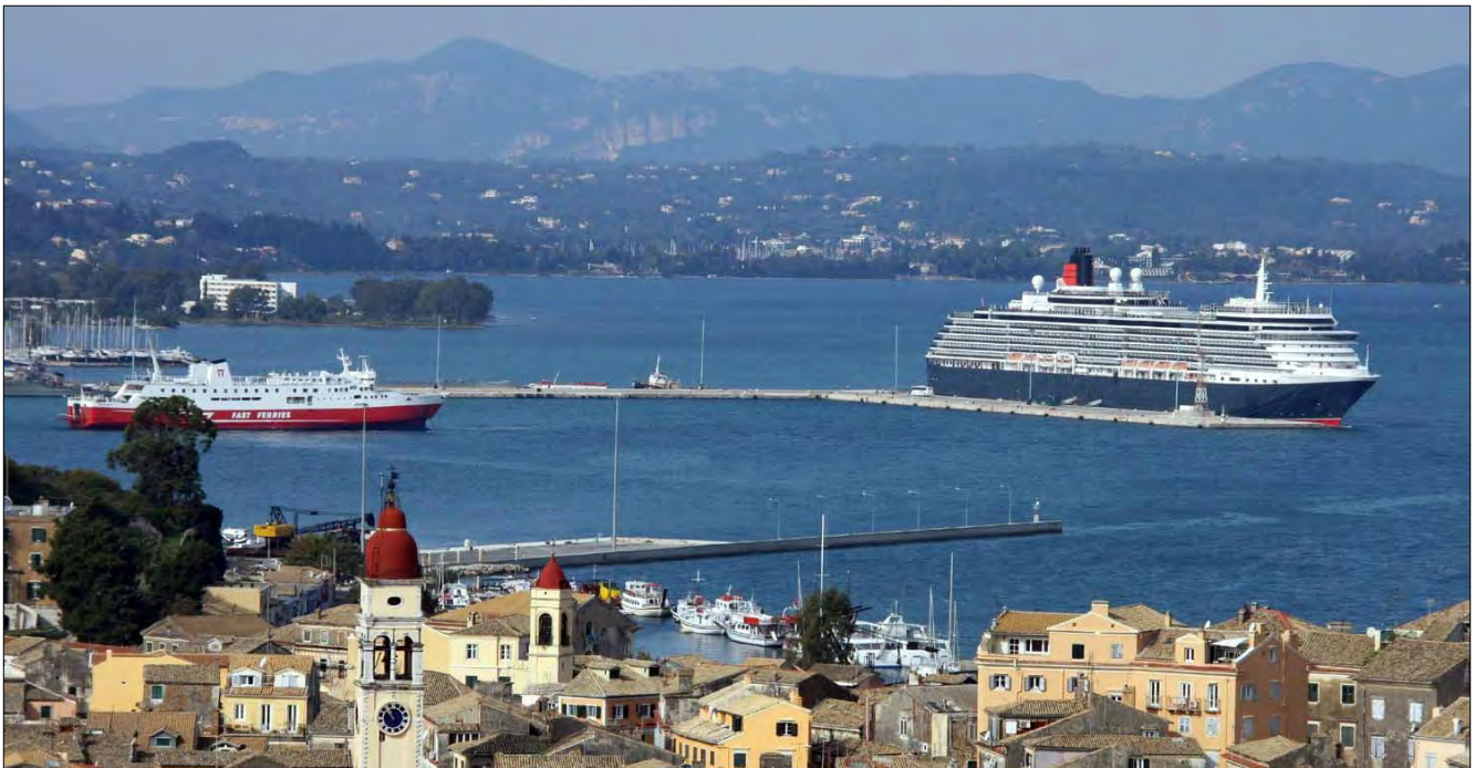
The QUEEN VICTORIA docked in Corfu, Greece, with the Sea Tower in the foreground, November 2, 2010.