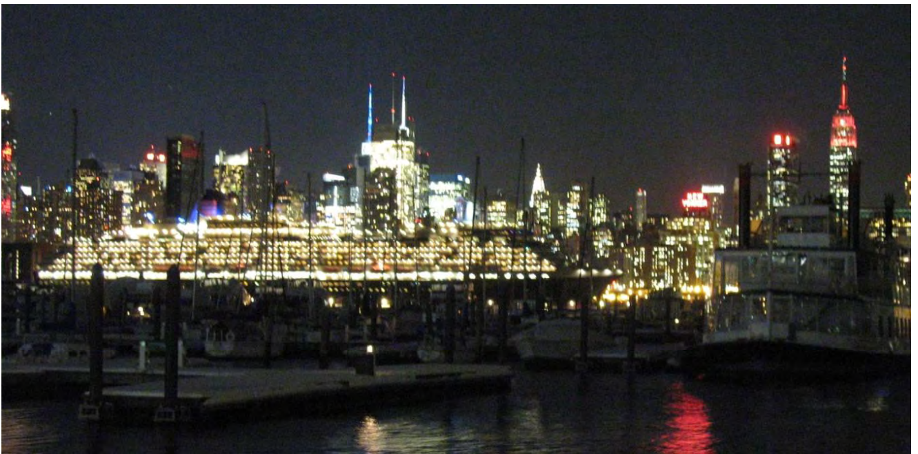
The QUEEN ELIZABETH passes midtown Manhattan en route to the "Royal Rendezvous." Note in this photo and the one above that the Empire State Building has been illuminated in Cunard Red.