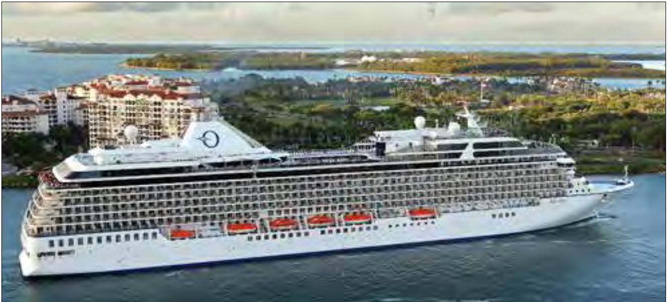
Oceania Cruises' first newly-built liner MARINA arrives on her Maiden Voyage to Miami.