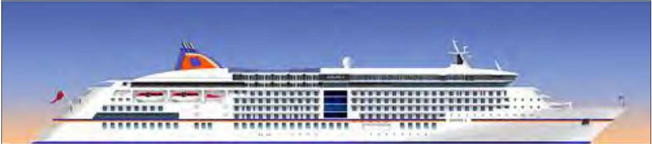
EUROPA 2 will be one of the most spacious and luxurious cruise ships afloat when she enters service in 2013.

will offer a slightly less formal version of their cruise product, featuring shorter itineraries. EUROPA 2, to be built by STX France in St. Nazaire, will be one of the most spacious ships in the world. At 39,500-tons, her tonnage will be nearly identical to that of the legendary OCEANIC, which carried 1,600 passengers, but EUROPA 2 will carry only 516. This gives her a remarkable passenger-space ratio (gross tonnage divided by passenger capacity) of 76, exceeding that of luxury vessels operated by Crystal and Regent Seven Seas. She will be built and owned by a third-party company outside of the Hapag Lloyd owner TUI group, and will be on a 12-year charter to Hapag Lloyd. COLUMBUS 2 will be the former INSIGNIA, on charter for two years from Oceania Cruises, and will start sailing for Hapag Lloyd in spring 2012. Construction on EUROPA 2 will commence in September 2011, with her maiden voyage scheduled for 2013.