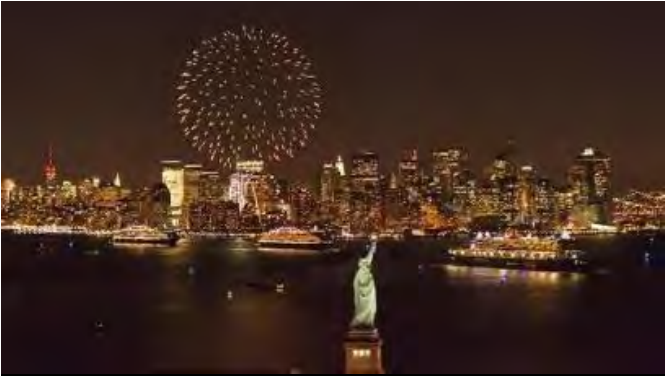
A spectacular aerial view of the three QUEENS with Manhattan in the background and the Statue of Liberty in the foreground.