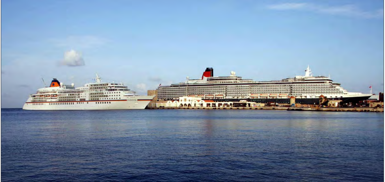
The EUROPA and QUEEN VICTORIA docked in Rhodes, Greece on November 8, 2010.