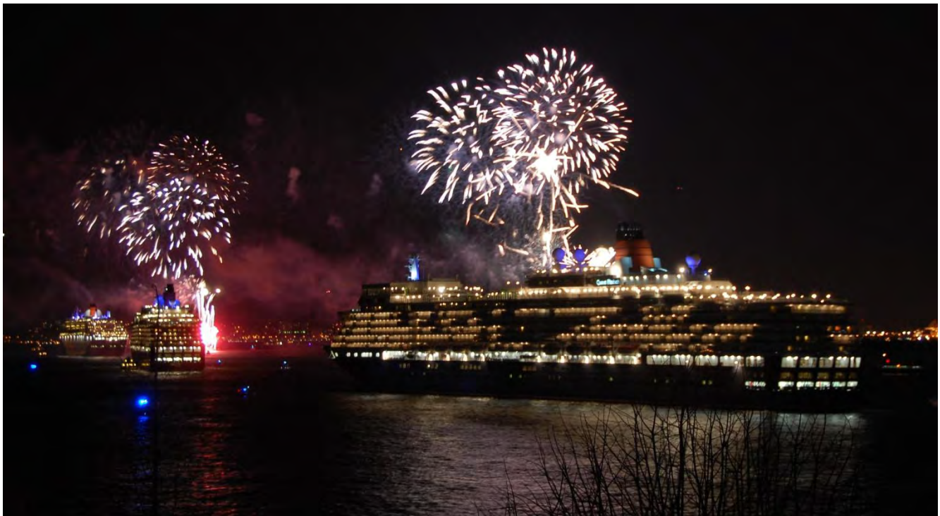
The three QUEENS and the Grucci fireworks display as seen from Battery Park in Lower Manhattan.

Our entire group then sought the warmth of the lower deck cabin and continued socializing until the ferry arrived back at Pier 78, where we dispersed to NY Waterway and cross-town buses and taxis, with an intrepid few heading east on foot.