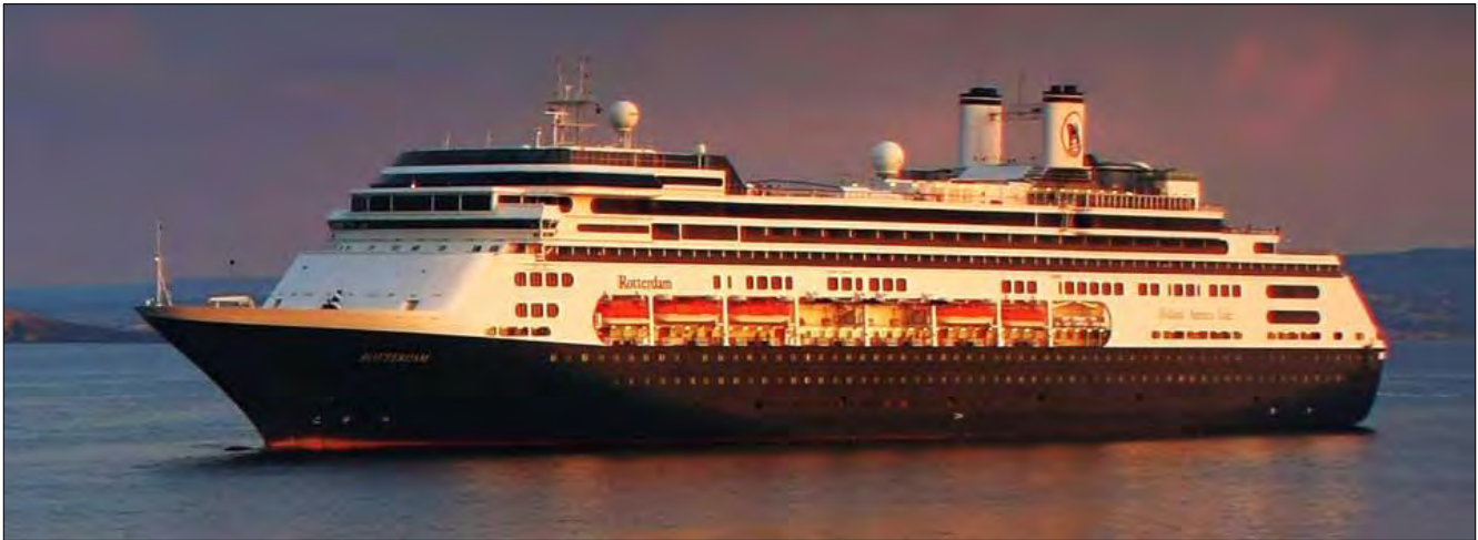
ROTTERDAM VI at Malta in 2010

We are pleased to announce a World Ship Society group cruise for 2011. It will be a 9-night transatlantic crossing on Holland America's ms ROTTERDAM (VI), with a pre-cruise option to stay on the ss ROTTERDAM (V), now a museum, hotel and convention venue in Rotterdam, Holland. See the enclosed flyer for information, rates and booking instructions.