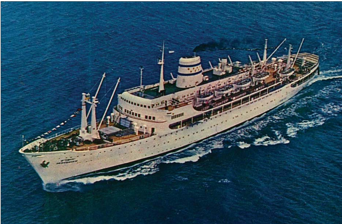
Zim Line's JERUSALEM was one of the first cruise ships to sail from the Port of Miami in the mid-1960's