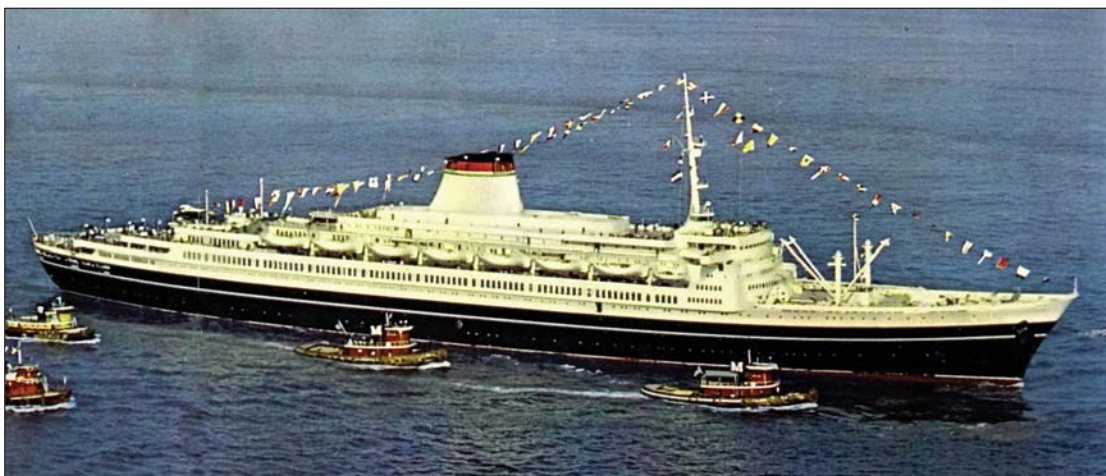
The sleek LEONARDO DA VINCI replaced the ill-fated ANDREA DORIA in 1960.