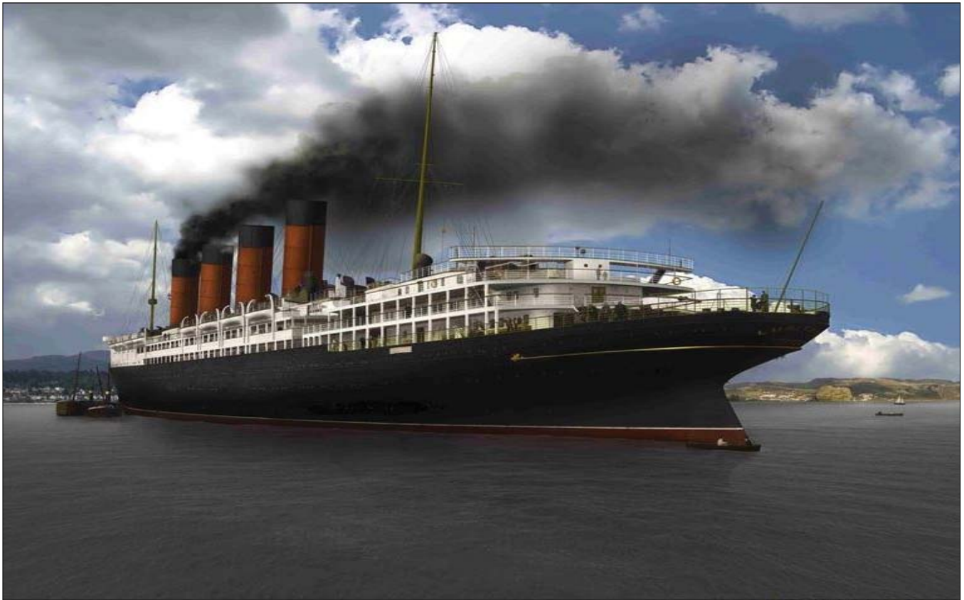
The R.M.S. LUSITANIA