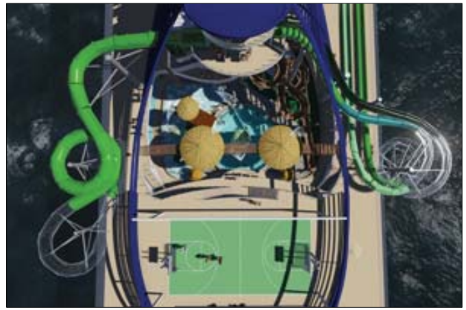
The stern view of MSC SEASIDE reveals panoramic elevators, a pool set close to the ocean, and a superstructure resembling a land hotel (left). SEASIDE's Aquapark features slides that extend far beyond the ship's side (right).

HOW MUCH FOR ROOM SERVICE? Some of the larger cruise lines continue to “unbundle” services: Norwegian Cruise Line has announced that they will be charging a $7.95 fee for room service in a test program on the BREAKAWAY and GETAWAY. Carnival Cruise Line will be charging for certain items on the room service menus, while other items will be free. Starting on April 12, there will be charges from $4 to $7 for sushi, chicken wings, fried shrimp and pizza on Carnival “test” ships IMAGINATION, CONQUEST and PRIDE.