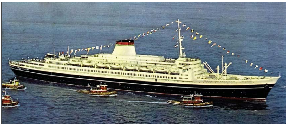
The sleek LEONARDO DA VINCI replaced the ill-fated ANDREA DORIA in 1960.